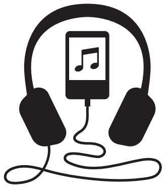
Music players and headphones